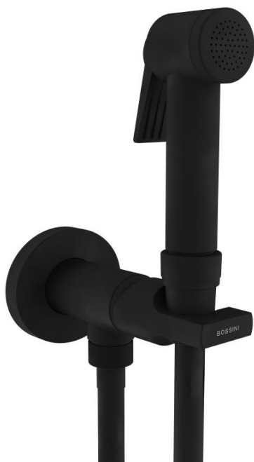
Immagine Prodotto - Product Image

механический смеситель с лейкой из АБС PALOMA-FLAT и шлангом Cromolux 125 см